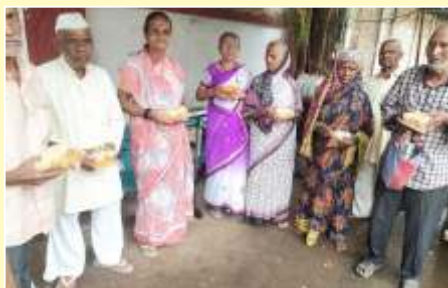
Navratri Fasting food distribution for Annapurna Beneficiaries