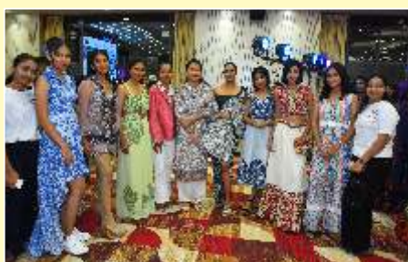
The fashion show beautifully showcased garments crafted from Solapuri chaddar, blending timeless textile heritage with contemporary elegance.