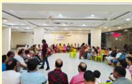
Monthly Dinner at Shribhoj - Family bonding time!!