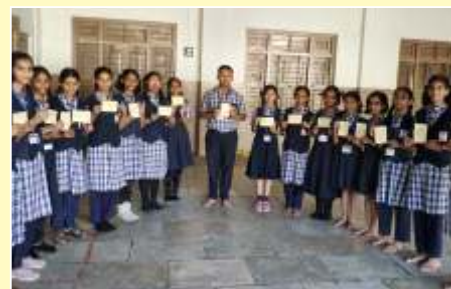
Students holding beautiful handwritten letters