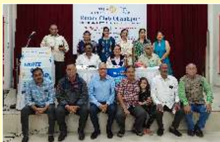
Weekly Meeting 11