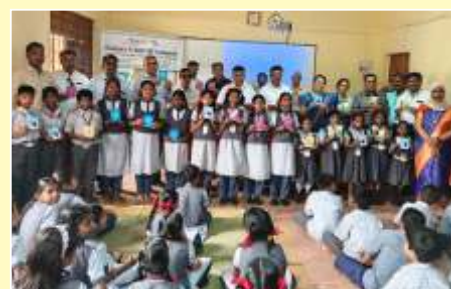
Inauguration Ceremony of Dictionary Distribution Project