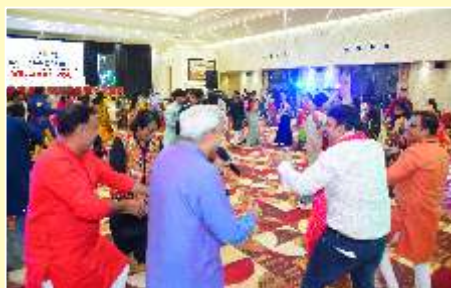
Dandiya event brought together over 600 enthusiastic participants, celebrating culture, community, and festive spirit with unforgettable energy and joy!