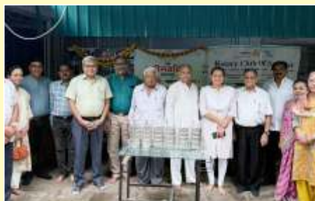
Tiffin Donation by Solapur Steel Merchants Association for Annapurna beneficiaries