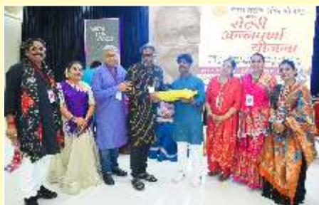
Dandiya Lucky Draw Winner