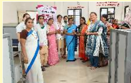
Felicitation of Health workers and staff of Duffrin Hospital