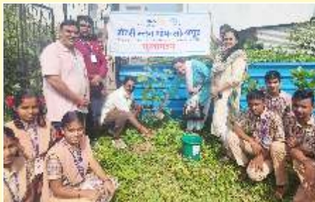
Tree Plantation at Roshan Prashala