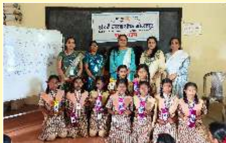
Distribution of Sanitary pads and awareness