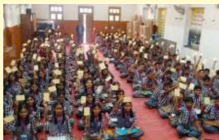
Mega Letter Writing Competition