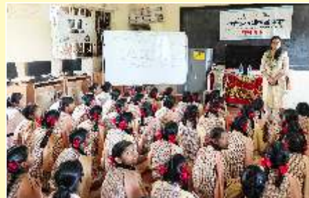
Seminar on Menstrual Hygiene at Roshan Prashala