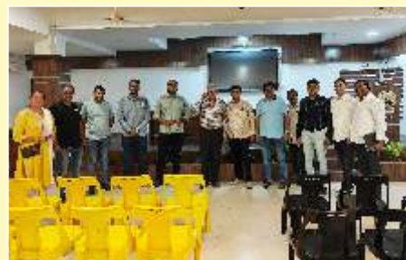
Working committee meeting for Rotaract Rise event