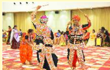
Dandiya Event - Ratri Before Navratri