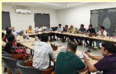
3rd Board Meeting