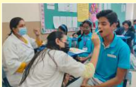
Mega Dental Check-up Camp at Podar Int. School