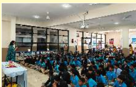
Seminar on Dental Hygiene and Oral Health