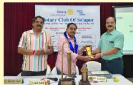
Weekly Meeting 13