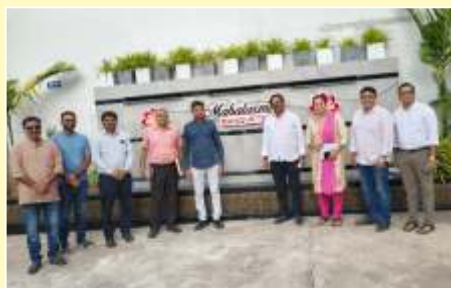
Working committee meeting for Dandiya event