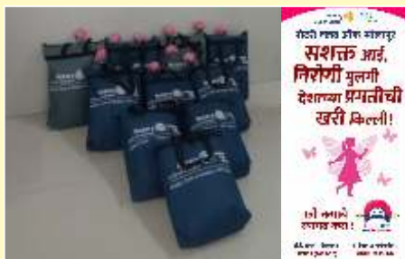
Great Public Image of our club for Save Girl Child Project