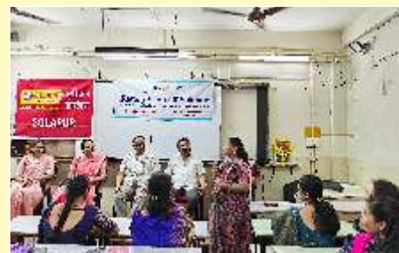
Skill Development Project - Spoken English Class for Ladies