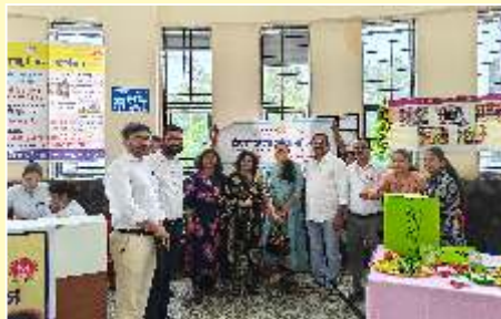
Breakfast provided for 300 beneficiaries at Civil hospital for Health Check-up Camp Swastha Naari - Sashakta Pariwar